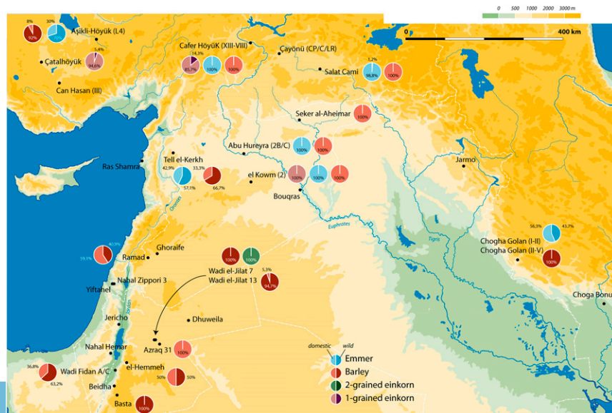
Fig. 3. Archaeological sites dated to 10.2–8.3 ka Cal BP (M/LPPNB in the Levant) with published archaeobotanical evidence. Sites where domesticated-type rachis scars comprise >10% of the assemblage are considered to represent evidence of incipient cereal domestication (based on Table S6).