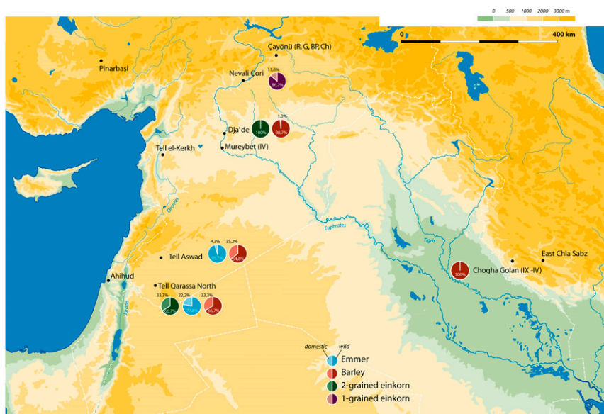
Fig. 2. Archaeological sites dated to 10.7–10.2 ka Cal BP (EPPNB in the Levant) with published archaeobotanical records. Sites where domesticated-type rachis scars comprise >10% of the assemblage are considered to represent evidence of incipient cereal domestication (based on Table S6).

The cereal assemblage from TQN (area XYZ-67/68/69) comprises wild and domesticated-type species of emmer wheat ( T. dicoccoides/dicoccum ), one- and two-grained einkorn wheat ( T. boeoticum/monococcum/urartu ), and barley ( Hordeum spontaneum/vulgare ) (Fig. S1), which account for 56.8% of the assemblage (72). In the case of einkorn, the results indicate the predominance of two-grained forms [61.2% based on minimum number of individuals (MNI)] over one-grained ones (38.8% based on MNI) (72). The size ranges (i.e., breadth and thickness) of the wheat and barley grains are comparable to those observed in modern reference specimens from wild uncultivated and cultivated populations (the latter including wild and domesticated species) (SI Text and Table S4). Emmer, two-grained einkorn, and barley show a majority of cultivated-type specimens (>70.0%), whereas only 12.1% of the one-grained einkorn corresponds to cultivated-type grains. The final analysis of the rachis remains from TQN includes a total of 732